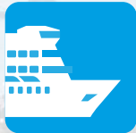
RoPax vessels and ferries