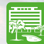
Leisure and hospitality facilities