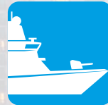
Navy and coast guard vessels