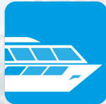
River cruise vessels