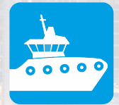
Workboat and special vessels