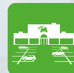
Supermarkets, warehouses and shopping centers