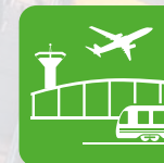
High traffic areas