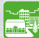
Universities, offices and institutions