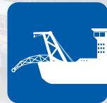
Construction and pipe laying vessels